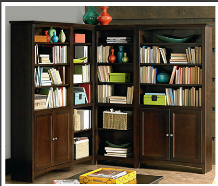
1545CAF 72"x36" Bookcases with Doors (FR & FL), 1524CAF 72"x24" Bookcases (FL/MR) & (FR/ML), 1509CAF Corner Connector in Caffè finish.

Explore the various options. If you need assistance your Whittier Wood Furniture Retailer can help.