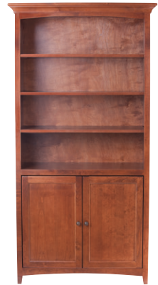
Center Wall Unit with Doors

39-1/2"W x 18-1/2"D x 76-1/2"H 4 Adjustable Shelves: 34-1/4"W x 15-1/4"D