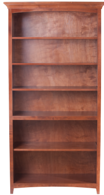
Center Wall Unit

39-1/2"W x 18-1/2"D x 76-1/2"H 4 Adjustable Shelves: 34-1/4"W x 15-1/4"D