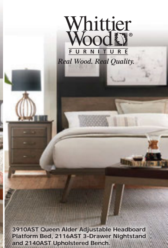
3910AST Queen Alder Adjustable Headboard Platform Bed, 2116AST 3-Drawer Nightstand and 2140AST Upholstered Bench.