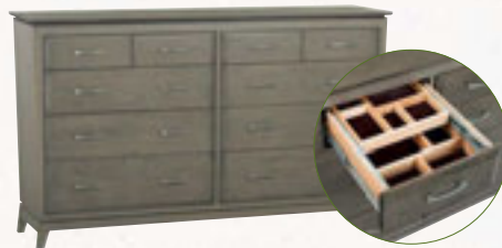
Jewelry tray detail.